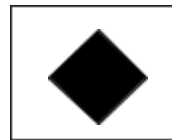
Black (most difficult)

Boundaries: The boundaries of the safe skiing/snowboarding areas are marked with ropes or signs, and are also marked on area maps. It is each person's responsibility to stay inside this area. If you are unsure of the boundaries, please ask mountain personnel for information. Mt. Washington Resort accepts absolutely no responsibility for anyone's safety outside these boundaries. Should a rescue of an "out of bounds" skier/snowboarder be required, it is likely that he or she will be held responsible for the expense of the rescue operation.